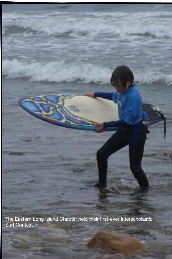
The Eastern Long Island Chapter held their first-ever Interscholastic Surf Contest.